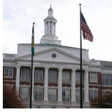
Greenwich Town Hall