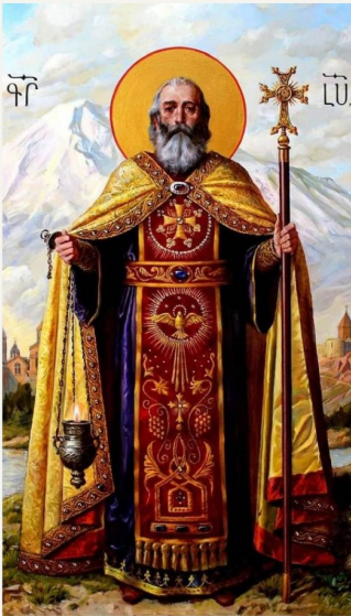
St. Gregory the Enlightener Armenian Church 1131 North street White Plains, NY 10605

The Primate will bring the relic of St. Gregory to be venerated during the service