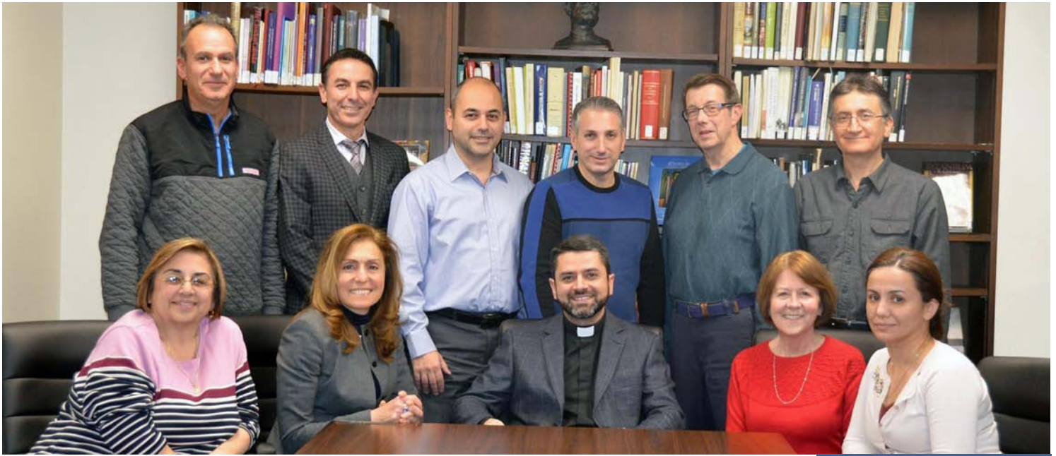
Parish Council, 2018-2019